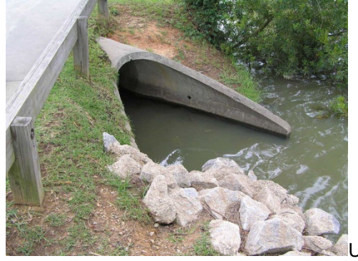
Use Pipe Flared End Section when specified in the

Use Pipe End Structure (719-615-00) when specified in the plans or special provisions. Use pipe end structure in locations where pipe exposed end faces the direction of traffic. Pipe end structures may be used in other locations if approved by the RCE.